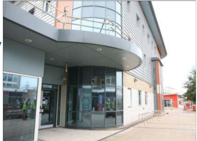
The Yate Health and Children’s Centre in Yate town centre – Shortly before completion

The Yate Health and Integrated Children’s Centre project, led by South Gloucestershire Primary Care Trust (PCT), is a fundamental part of the Bristol Health Services Plan (BHSP) to bring specialist healthcare services out of District General Hospitals and to the communities that use them. The centre will re-house PCT community services, a GP surgery and a pharmacy and provide a local base for outpatients, minor injuries and diagnostic services.