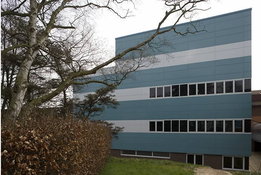
New Theatre & Endoscopy Building