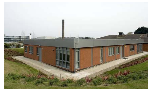
HYMS Postgraduate Education Centre

The design optimises patient flow and staff access in and around the critical areas of theatres and endoscopy suites.