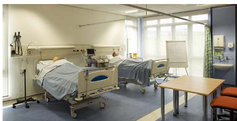
HYMS Teaching Facility

Fully understanding the Trust's needs, both clinically and operationally, resulted in a building with a layout and flow which was 'right first time'. This allowed the Trust to test the design earlier than planned against its strategic objectives, improving access, reducing waiting times, developing new roles and ways of working and most importantly, improving patient experience and the environment.