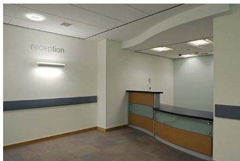
Main Reception Area