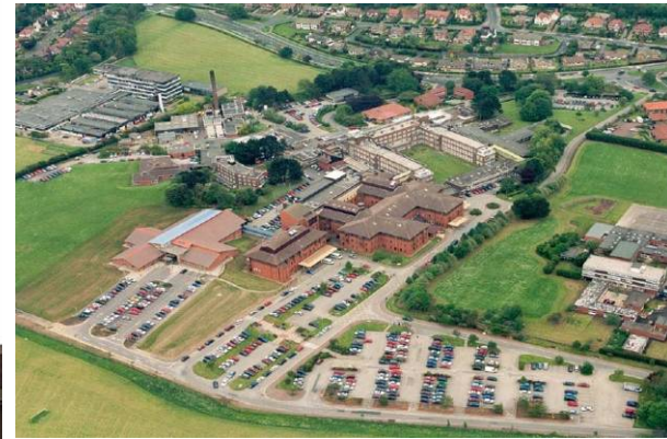
Scarborough General - Prior to Project Commencement

"For a project of this size and complexity to be completed on schedule and under budget to such a high specification is a truly remarkable achievement"